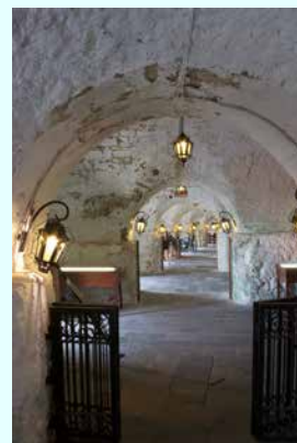
Forte de São Brás