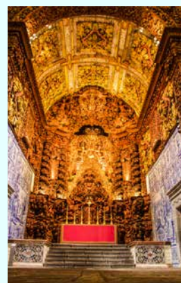
Wooden Alter in Museu Carlos Machado