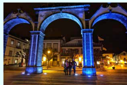
Portas da Cidade

📍 Gruta do Carvão Small underground caves outside the city center. The hour long tour costs 5 Euros and the first 15 minutes is an old video. It's not a must, but a good option if it's raining and underground caves sound interesting to you. Open every day (10am – 12:30pm) (2 – 6pm). (☂️)